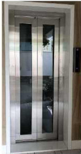
Auto Glass Doors